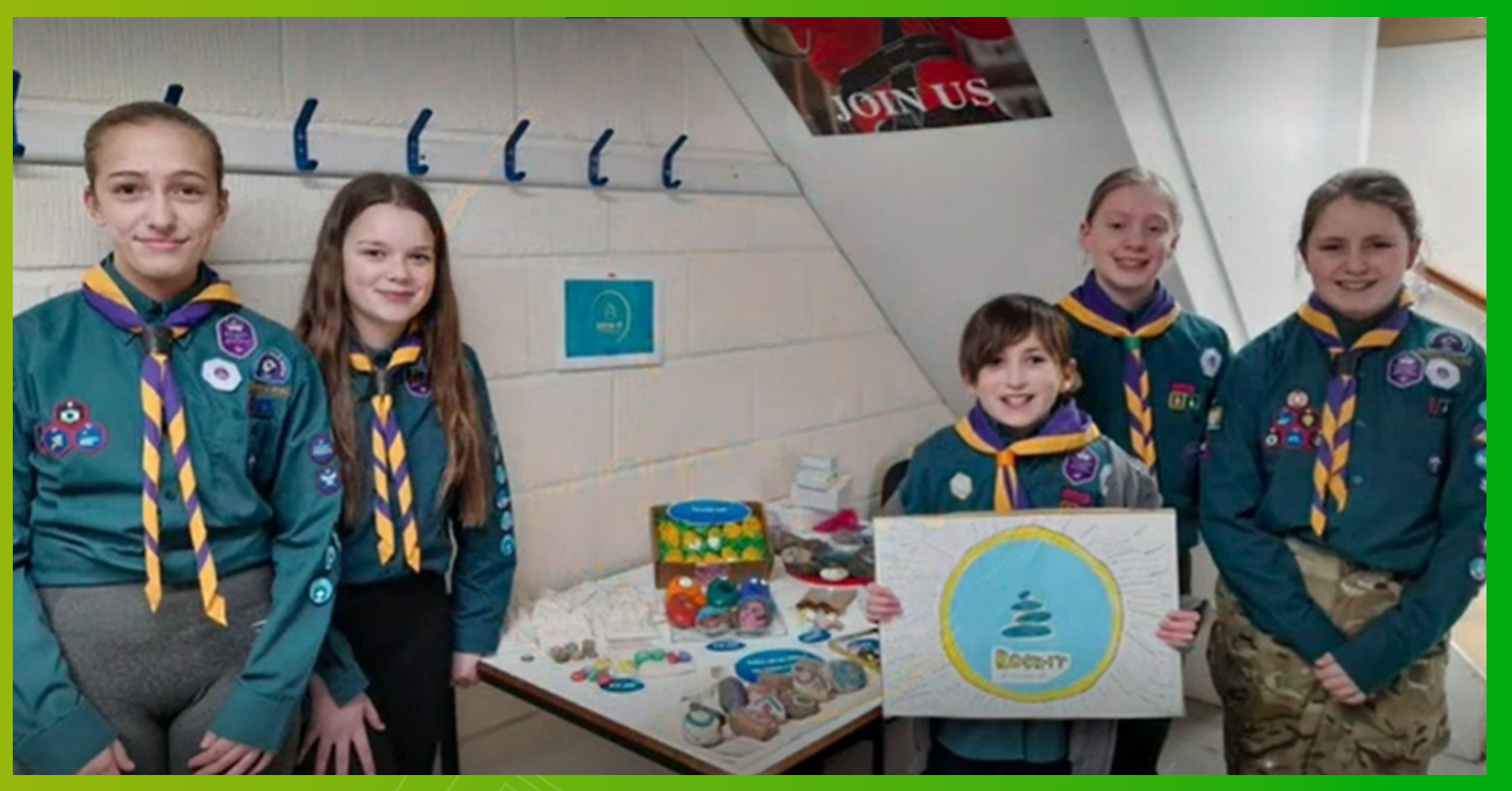
Team TMLS, Greenseed Gardening; Rock-IT.